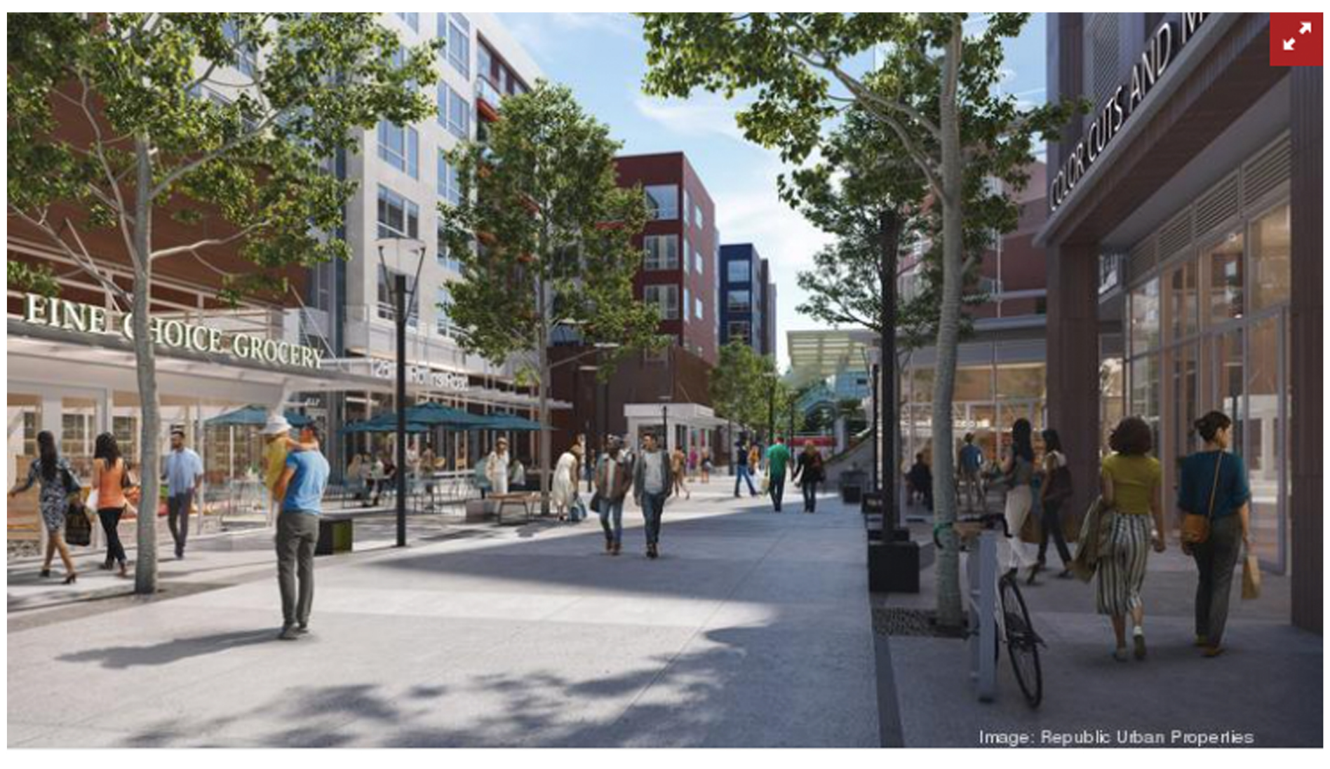
A rendering of Gateway at Millbrae Station.